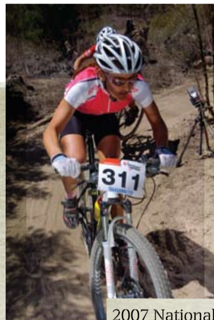
2007 National Championships (2nd)